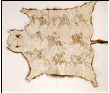
Buffalo hide painted about 1880 by Oglala Lakota (Sioux) named Young Man Afraid of His Horse. Depicts the actions of traditional warriors in battle. 2

For thousands of years, American Indian men have protected their communities and lands. "Warrior" is an English word that has come to describe them. However, their traditional roles involved more than fighting enemies. They cared for people and helped in many ways, in any time of difficulty. They would do anything to help their people survive, including laying down their own lives.