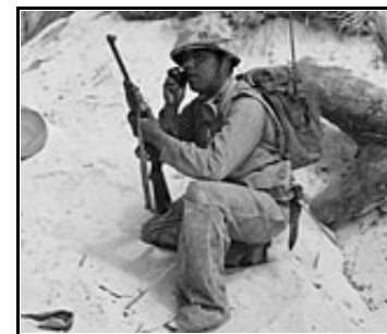
Unidentified American Indian Marine uses a "Walky-Talky" to send communications in the South Pacific, November 1943. 5

Code Talkers were given the messages in English. Without writing them down, they