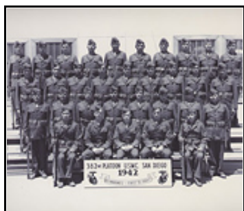
United States Marine Corps Platoon 382, made up of the first 29 Navajo Code Talkers, 1942. 4

After the Navajo code was developed, the Marine Corps established a Code Talking school. As the war progressed, more than 400 Navajos were eventually recruited as Code Talkers. The training was intense. Following their basic training, the Code Talkers completed extensive training in communications and memorizing the code.