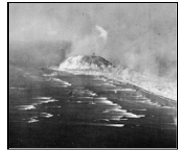
Sixth Fleet during the invasion of Iwo Jima, with Mt. Suribachi in the background, 1945. 7