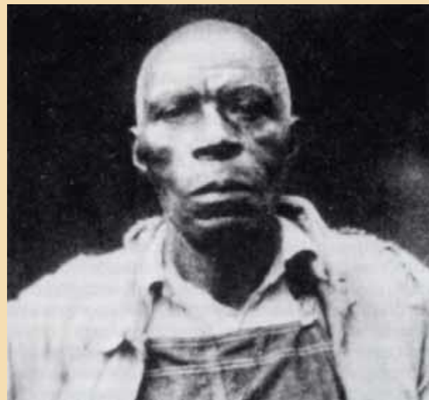
Sea Island Gullahs, about 1930.