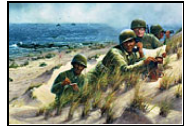
"Indian Code Talkers," painting by Wayne Cooper depicting Charles Chibitty during the D-Day landings at Utah Beach. 9

Well, I was afraid and if I didn't talk to the Creator, something was wrong. Because when you're going to go in battle, that's the first thing you're going to do, you're going to talk to the Creator. —Charles Chibitty, Comanche Code Talker, National Museum of the American Indian interview, 2004