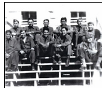
Comanche Code Talkers of the 4th Infantry Division, 1941. 3

After the Navajo code was developed, the Marine Corps established a Code Talking school. As the war progressed, more than 400 Navajos were eventually recruited as Code Talkers. The training was intense. Following their basic training, the Code Talkers completed extensive training in communications and memorizing the code.