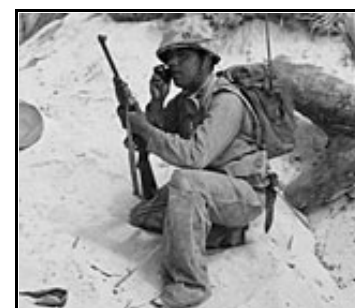
Unidentified American Indian Marine uses a "Walky-Talky" to send communications in the South Pacific, November 1943. 5

Code Talkers were given the messages in English. Without writing them down, they