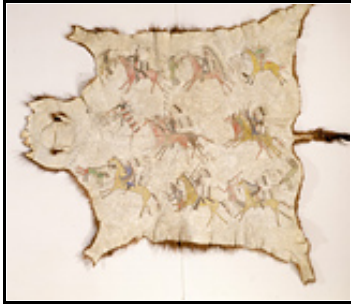
Buffalo hide painted about 1880 by Oglala Lakota (Sioux) named Young Man Afraid of His Horse. Depicts the actions of traditional warriors in battle. 2

For thousands of years, American Indian men have protected their communities and lands. “Warrior” is an English word that has come to describe them. However, their traditional roles involved more than fighting enemies. They cared for people and helped in many ways, in any time of difficulty. They would do anything to help their people survive, including laying down their own lives.