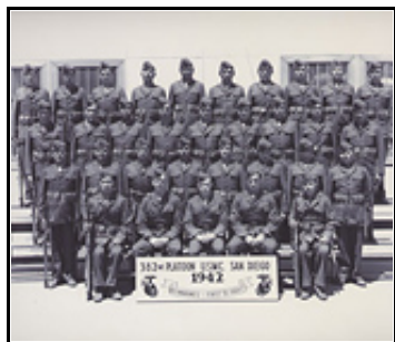
United States Marine Corps Platoon 382, made up of the first 29 Navajo Code Talkers, 1942. 4

After the Navajo code was developed, the Marine Corps established a Code Talking school. As the war progressed, more than 400 Navajos were eventually recruited as Code Talkers. The training was intense. Following their basic training, the Code Talkers completed extensive training in communications and memorizing the code.